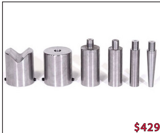
Press Brake Tooling Set